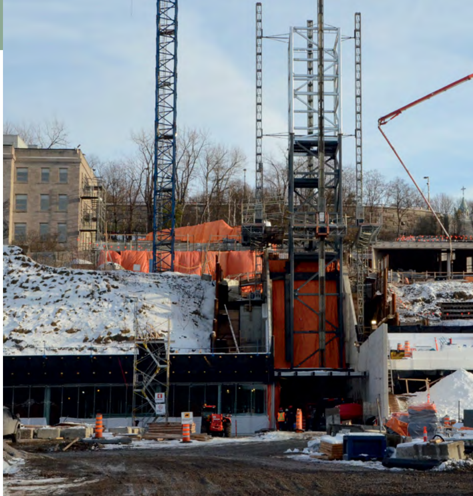
The concrete structure of the future Reception Pavilion is taking shape on several levels to the west of the Sainte-Croix Pavilion. In the center, a steel structure will receive the bells of the restored carillon.

During the winter months, workers were busy inside the building setting up the infrastructure for the reception and food services as well as the Gift Shop. In addition, the construction of the long corridor that will link the pavilion and the shrine is well underway.