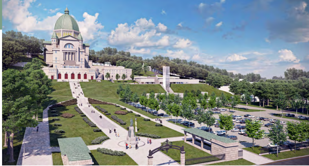
Illustration: Lemay, Architecture and Design

The future pavilion will be heated with geothermal energy , essentially drawing heat from the ground. Very deep wells were drilled and, thanks to a closed loop glycol system, heat from