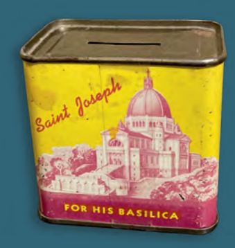
This vintage piggy bank reminds us that all donations are important. It was true yesterday, and it remains true today.

Enormous efforts were made to erect the Oratory Basilica on Mount Royal. Repeated popular subscriptions and the diligent donations from contributors greatly helped to raising the funds required for such an extraordinary construction. More discreetly, personal and family piggy banks played their part by collecting, day by day, spare change offered to "Saint Joseph for his Basilica," as it was written on the small tin box. It was suggested to accompany the act of offering with a prayer to the great saint, ending with: "As a token of our confidence, we lovingly deposit this small offering, as a humble contribution..." Finally, the piggy bank featured the smiling face of Brother André and his conviction-filled words: "It will succeed, Saint Joseph's temple will be completed."