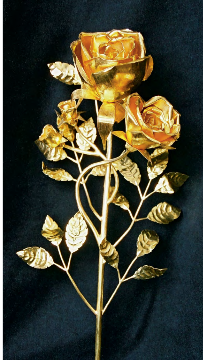
The Golden Rose offered by Pope John Paul II to mark the centennial of Saint Joseph's Oratory of Mount Royal, in 2004.

Since the 11 th century, this distinction has been awarded to monasteries, sanctuaries, sovereigns, and personalities to highlight their commitment to faith and the common good. In 2004, Saint Joseph's Oratory of Mount Royal became the first shrine in Canada to have its name added to the list of recipients.